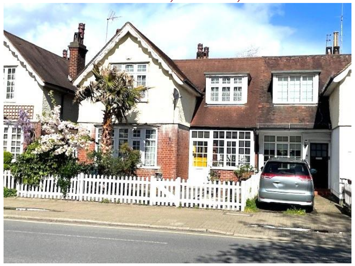
FOR SALE £699,950 Freehold

Major Estates Harrow LTD ~ 77 High Street, Wealdstone, Harrow, HA3 5DQ T: 020 8424 8686 ~ E: sales@majorestate.com ~ www.majorestate.com